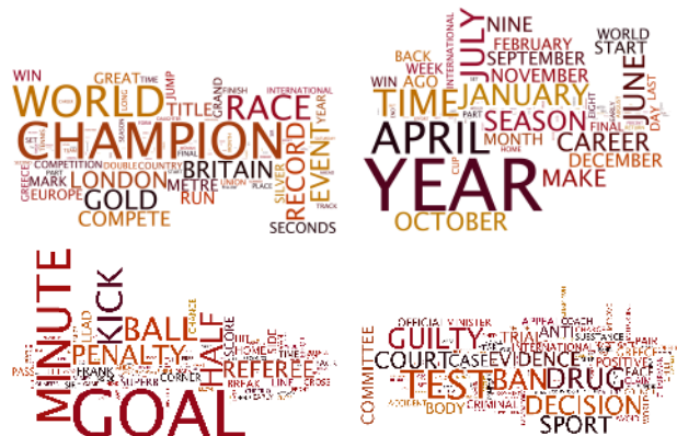
Figure 2: Word clouds representing 4 of the 15 topics learned on BBCsport in English. Top-left topic: competitions. Top-right: time. Bottom-left: soccer actions. Bottom-right: drugs.

Lauly et al. [2014] propose a bilingual word representation that maps words in two different languages to the same Euclidean space. By setting the vocabulary of the topics as a subset of the words in the target language, we can learn topics in that language. Figure 3