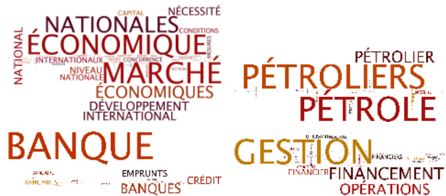
Figure 4: Word clouds representing 4 of the 24 topics learned on Reuters in French. Top-left topic: international trade. Top-right: oil and other resources. Bottom-left: banking. Bottom-right: management and funding.