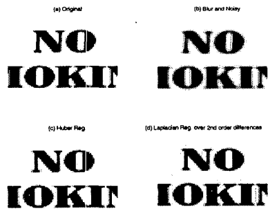
Fig. 1. Results of the first test image.