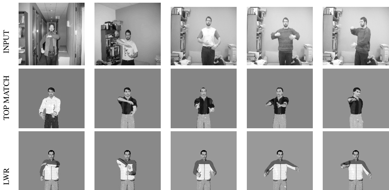
Figure 5. More examples, including typical “errors”. In the leftmost column, the gross error in the top match is corrected by LWR. The rightmost two columns show various degrees of error in estimation.