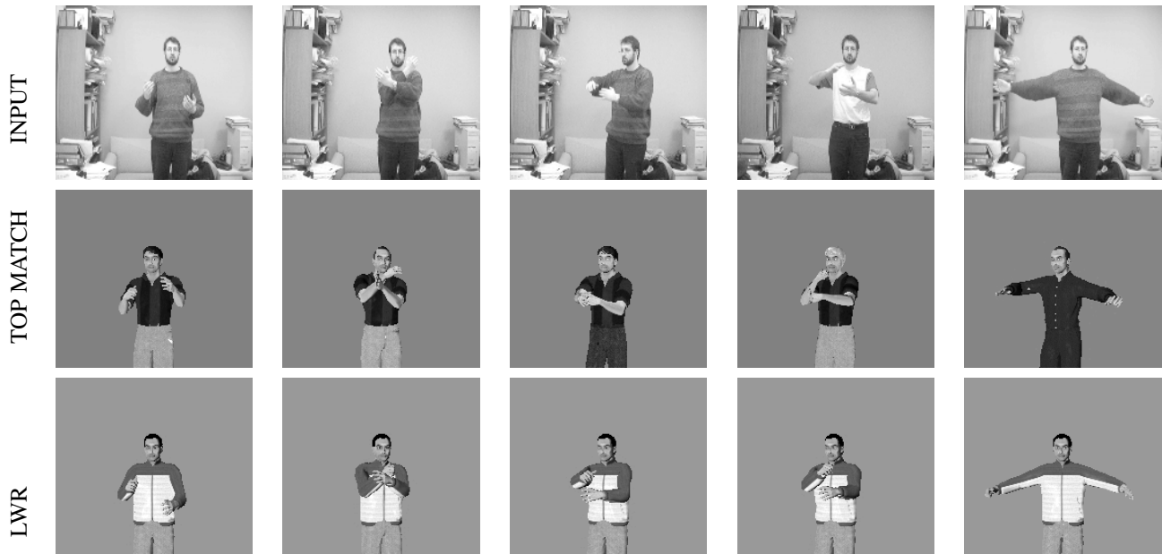
Figure 4. Examples of upper body pose estimation (Section 4). Top row: input images. Middle row: top PSH match. Bottom row: robust constant LWR estimate based on 12 NN. Note that the images in the bottom row are not in the training database - these are rendered only to illustrate the pose estimate obtained by LWR.