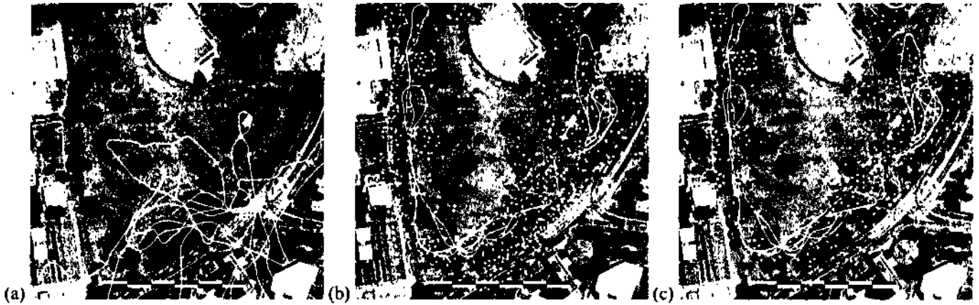
Figure 1: FastSLAM 2.0 applied to the Victoria Park benchmark data set. (a) Raw vehicle odometry (b) FastSLAM 2.0, M=1 particle (c) FastSLAM 2.0 with dynamic feature management.

At first glance, one may be tempted to substitute w_t^{[m]} for the probability on the right-hand side, as in regular FastSLAM. However, w_t^{[m]} does not consider the sampled pose s_t^{[m]} , whereas the expression here does. This leads to a slightly different probability, which is calculated as follows.