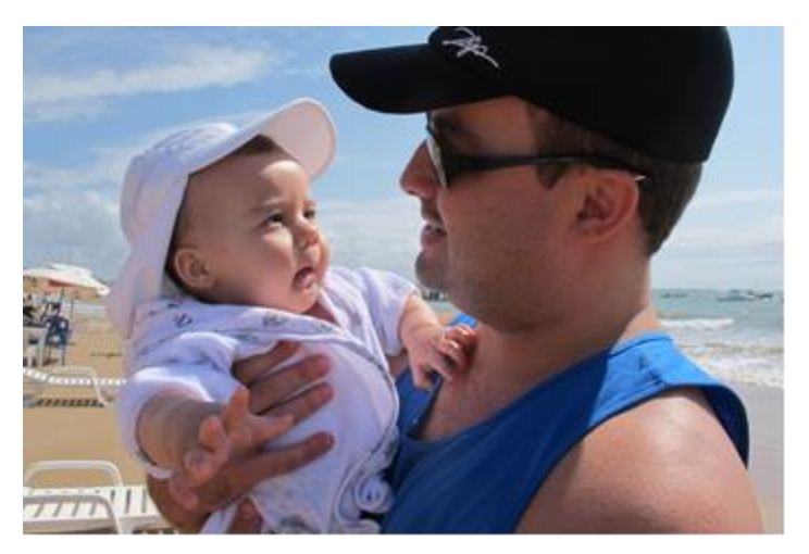
Middle class 30 year-old architect with his 8 month-old daughter at beach at Salvador City, Bahia, in Northeastern Brazil.