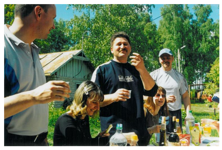
Russian fathers and mothers drink vodka at school reunion in public park (Kaluga).