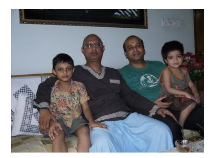
Two affluent, urban (Dhaka), educated fathers (banker and businessman) with their sons at a family gathering.