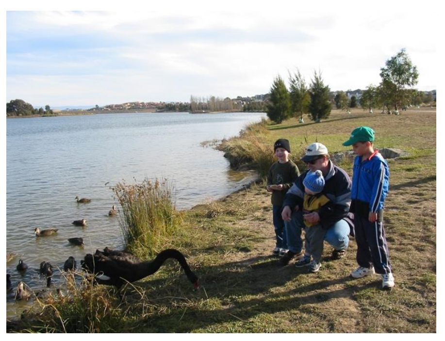
An upper middle-class father in his 30s, lakeside with children ages 2, 6, and 8 in Canberra. Owing to expansive geography and mild climate, outdoor recreation is popular with fathers.

First, Smyth et al. (2013) claimed that in demographic terms Australian fathers and families have many similarities to their counterparts in other Western societies, e.g., declining marriage rates, marriage and childbearing at a later age, decreasing family size, and increasing numbers of social fathers.