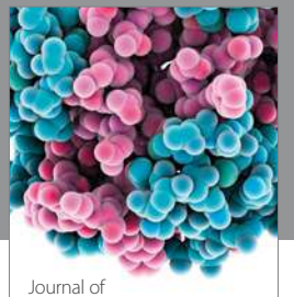
Journal of Diabetes Research