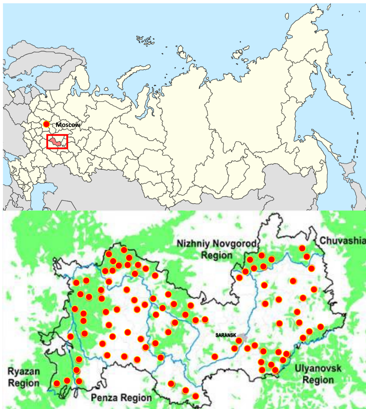
Figure 1. Study sites of click beetles in the Republic of Mordovia in 2006-2017 (red dots)

There are given references to the literature on the species from the territory of Mordovia (in case there is a reliable indication of the point of discovery it is mentioned either), new collection sites (previously unpublished information), collection date, number of collected specimens, surname of the collector, notes (if any) for each species in the annotated list below. In the absence of new unpublished material of the authors, the section "Material" is not given in the article.