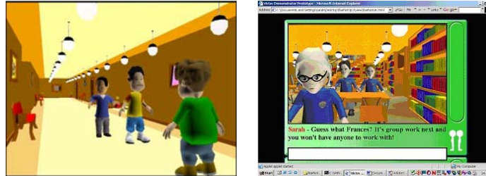
Fig. 1. Screenshots from FearNot

FearNot aims to enable children to explore physical and relational bullying issues, and coping strategies, through empathic interaction with the synthetic characters who populate the virtual school. This is achieved through providing scenarios in which the main purpose of the communication was to engage in social interaction as opposed to accomplishing a task as efficiently as possible.