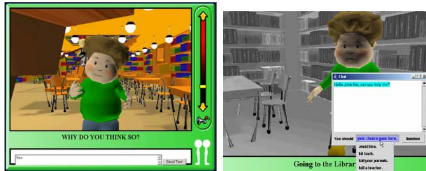
Fig. 3 Interaction with victim

In the scripted version of FearNot, the child user views one direct physical bullying scenario and one relational scenario. Physical bullying includes acts such as hitting, kicking, punching, and taking others' belongings and relational bullying is the purposeful damage and manipulation of peer relationships and feelings of social exclusion.