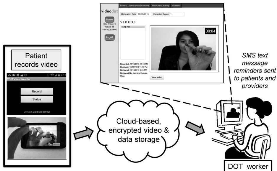
Figure 1 VDOT system flow diagram. VDOT = video directly observed therapy; SMS = short message service.

impractical for patients living far from health centers. The effectiveness of DOT compared with self-administered therapy has been questioned, 11,12 possibly due to implementation barriers, suggesting the need for improvements in DOT delivery. In low-/middle-income countries, resource constraints significantly limit DOT use. 13