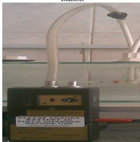
Fig.4: Air sampling train and adsorbent tubes arrangement followed by sampling holders

and 24 others by activated charcoal. The mean adsorption capacity of the used hydrocarbons by activated charcoal and marine coral powder was obtained 50.87 and 1.53, respectively (Table 2).