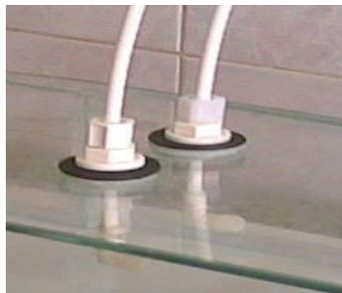
Fig.3: Holders arrangement in the dynamic chamber

In this study, 48 samples were prepared and tested as follows: 24 samples from marine coral powder