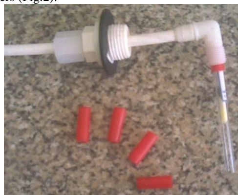
Fig.2: Sampling holders designed for dynamic chamber sampling

The marine corals were obtained from the south coasts of Iran. In order to the marine coral pretreatment, washing with methanol (3 times) and heating (1h; 70°C) to evaporate water, pollution elimination and pore expansion were used. Then massive marine coral were ground and sieved through a 20/40mesh screen. 0.15g marine coral was packed at a glass tube similar to charcoal tube (7 cm L, 4mm ID.) followed by end capping with holders (Fig.2).