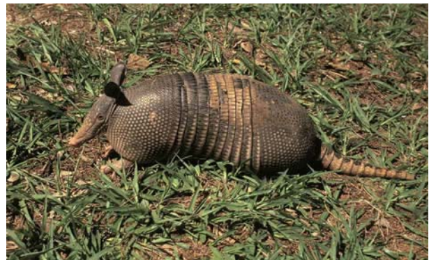
Figure 3. The nine-banded armadillo ( Dasypus novemcinctus ).

Twenty-four (35.3%) items were plant material and 44 (64.7%) were animal material (see Appendix). By frequency of occurrence, the wolf consumed plant and animal items in similar proportions (49.3% and 50.7%, respectively; Table 1). Even though the sample portrays the diet of a few individuals, these results are in the range shown in other studies (Dietz 1984, Motta-Junior et al. 1996, Motta-Junior 2000, Aragona & Setz 2001), which also described a typically omnivorous diet for this canid. The most consumed items in our study (Table 1) were rodents (22.5%) and miscellaneous fruits (20.6%). In contrast, according to the biomass ingested, the most important items were armadillos (36.2%) and wolf's fruits (19.6%) (Figs. 3 and 4, respectively) (Table 1). Although the most abundant armadillo species at ESI were Cabassous unicinctus and Euphractus sexcinctus (Bonato 2002), the maned wolf consumed mainly Dasypus spp. (see Appendix). It is possible that the low incidence of C. unicinctus in the wolf's diet is due to its primarily diurnal habits (Bonato 2002) and its fast-digging ability (Redford