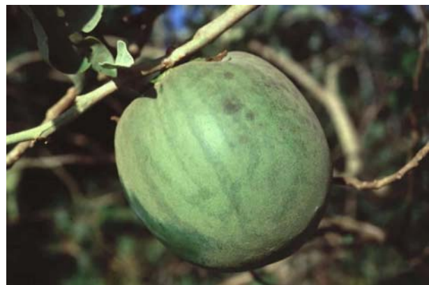
Figure 4. The wolf's fruit ( Solanum lycocarpum ).

1994). The lack or low consumption of the diurnal-nocturnal E. sexcinctus (Bonato 2002) noted at ESI (this study) and reported for other areas (Motta-Junior et al. 1996, Motta-Junior 2000, Belentani 2001) may be explained by an escape strategy that includes mainly running and secondarily digging (Redford 1994). On the other hand, Dasypus spp. (Fig. 3) is commonly reported in the maned wolf's faeces, even though they were not frequently found at ESI (Bonato 2002), suggesting higher vulnerability to predation or selection by the wolf.