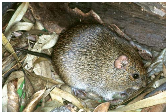
Figure 7. The spiny rat Clyomys bishopi .