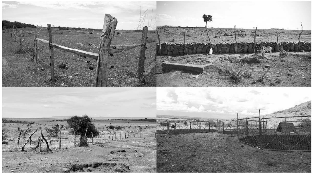
Figure 1. Examples of fences in the Greater Mara. By Mette Løvschal.

new game-proof fence to be built in 1966 that cut off and redirected a wildebeest migration with directly observable negative consequences on population size 11 .