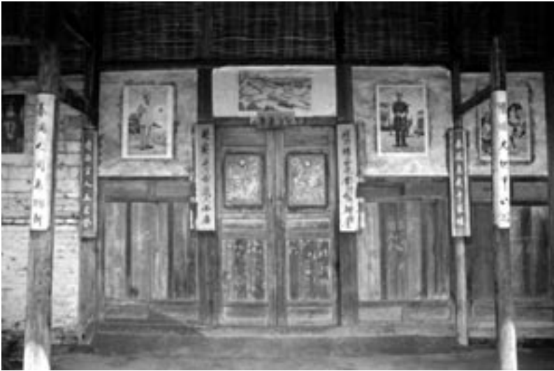
Figure 5.1: Traditional entrance adorned with powerful images

task of siting, people invite or consult geomancers on a number of occasions that in Baohua may also be accounted for by means of the geomancers' own categories of prosperity ( cai ), happiness ( fu ), long life ( shou ), and procreation ( zi ), also representing the popular Chinese fortune-bringing characters. Many instances of such fengshui uses are quite similar to those already described in the previous chapter and need not to be repeated. Moreover, many cases originating in both fieldwork areas are analysed in the next chapter. Instead, those features of fengshui thought and practice that differ from the Sichuan fieldwork area are highlighted.