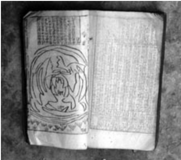
Figure 4.1: One of the few pre-liberation books on fengshui that survived the Red Guards' book-burning

speak of the effects of the unbearable mental strains that the starvation and deaths have caused. In the poorer villages countless people, young and old alike, are still unusually bony, crooked and bent, with grim toothless faces. These people are a living testimony to the perverse political experiments that lasted twenty years from the late 1950s onwards. No wonder that Longquan was closed to foreigners until recently; its villagers would have rendered a sombre portrait of a proletariat under central dictatorship, if not scaring off visitors prematurely.