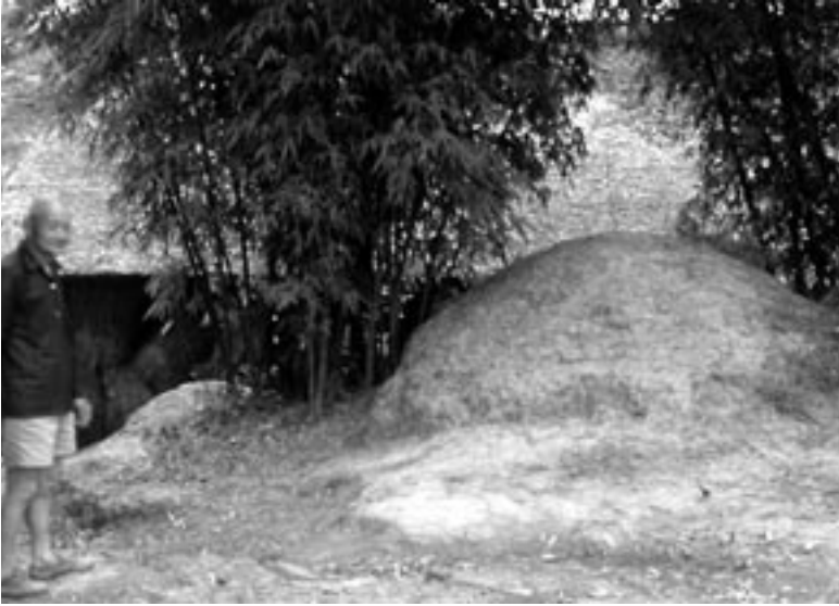
Figure 4.6: Mr Luo showing the landlord's grave on his property

and relatives from outside. They begin in the early morning hours, well advised by the geomancer so that the coffin may be taken to the tomb without official interference. Sometimes the coffin is carried to its resting place before the procession starts. First to appear in the procession is a man with a basket, running ahead while generously spreading 'road money' ( malu qian ) – elongated sheets of plain paper – to appease the spirits and open the road for easy passage of the procession. Then comes a number of people carrying gifts and expressions of honour to the deceased, including paper wreathes and garments. Next may follow carriers of large paper constructions, for instance models of houses and automobiles, which will be burned and transposed to the world beyond to make life comfortable for the deceased. Finally come four people carrying either the coffin or a sedan chair with the urn, and after them follow the rest of the procession, easily numbering 50 to 100 people.