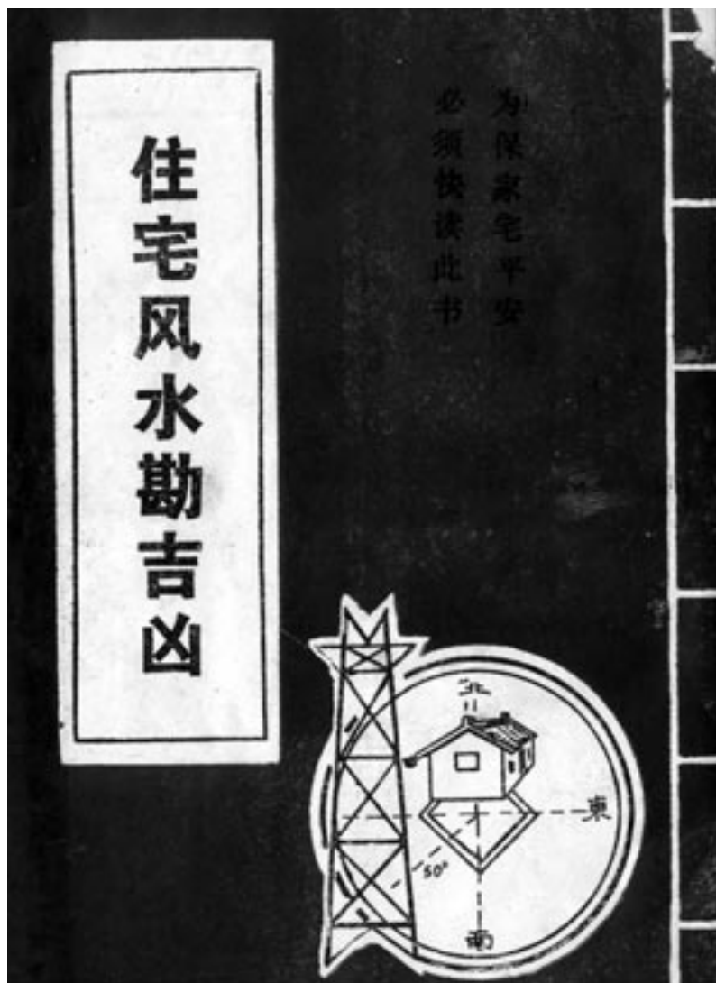
Figure 3.1: Illegal booklet of divination circulated in Sichuan