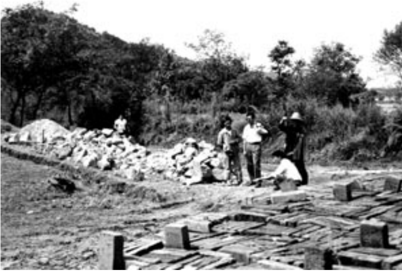
Figure 5.2: Seeing fengshui, although the circumference of the house is already indicated

turmoil, since conflicts easily escalate out of control, as in one particular case described below. In the villages where a lineage or a single-surname group prevails local organization and informal leadership will usually assure reconciliation when conflicts arise, but in the villages that accommodate competing surname groups matters are more complicated. These are common occurrences, which may also involve geomancers. For instance, in the village of Nantou two neighbouring families belonging to different surname groups got into a row when one of them built a new house slightly exceeding the lines of their neighbours'. The housebuilders argued that the doorway and rooftop of the neighbouring house had already broken the lines so that fengshui was not disturbed. With the intervention of the village leader it was agreed that a geomancer should be consulted to settle the matter. Each family invited its own geomancer, however, and as could be expected the geomancers proved loyal to their clients and ruled differently. A third geomancer was called in from another district, paid jointly by the two families, but when he heard that he necessarily had to rule against one of his own kind he rushed away and the two families were back to square one. Finally, when the entire village was embroiled through lines of kinship and loyalty, it was