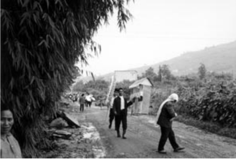
Figure 4.4: Funeral procession, carrying a modern-style paper house for the deceased