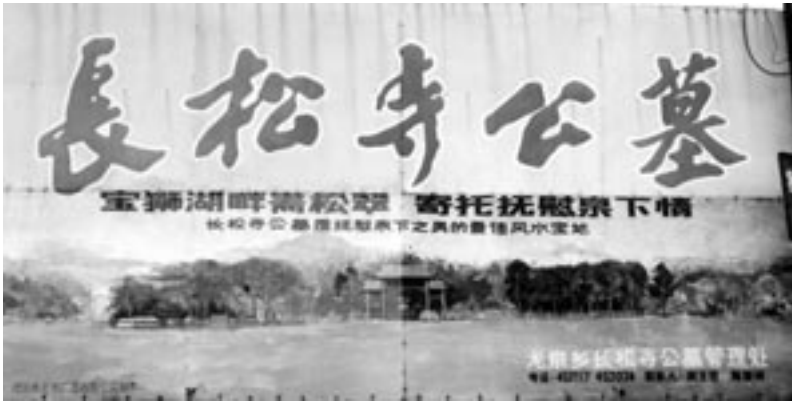
Figure 4.7: Road sign announcing the good fengshui of a public graveyard in a development zone

potential clients, whom the geomancers depend on for their livelihood and whose behaviour public authorities monitor for the sake of public order and the maintenance of the political status quo. Among these parties, fengshui takes on different roles and meanings, not as a unified system of belief, but as an aggregation of ideas, practices and pieces of knowledge that derive from various sources: old classics, the teachings of local masters in pre-liberation times and new constructions by the present generation of geomancers. These elements are constantly combined in new and unique patterns by the highly creative agents and forces at play.