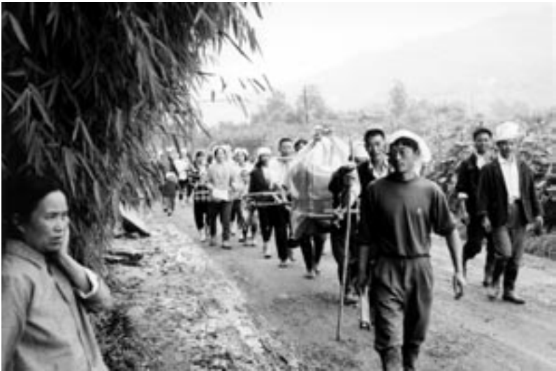
Figure 4.5: Funeral procession – the urn