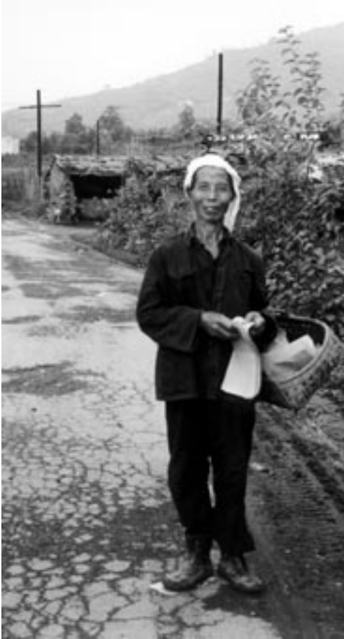
Figure 4.3: Spreading 'road money' ahead of the funeral procession

For the individual, spanning these highly diverse fields of reference requires knowledge of each individual field – certainly not a comprehensive understanding of every detail, but at least a basic knowledge that enables him to act in a meaningful and purposeful way according to the complex interplay between his own objectives and the demands of the situation. Different people obviously have different approaches to the religious domain, and the application of knowledge merges with common acts of positioning. According to the opinion of several geomancers, local people consider fengshui, or