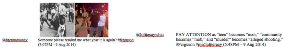
Figure 4. Popular tweets from @brennamuncy [7,200+RTs] and @lolitasaywhat [4,300+RTs], both of whom have few followers yet became crowdsourced elites in the first week of the Ferguson network.

Together, these tweets illustrate the labor undertaken by members of networked counterpublics who cannot offer firsthand accounts of an important unfolding event but can offer relevant collective memories and institutional critiques. Notably, none of these non-elite, individual crowdsourced elites had particularly large Twitter followings at the time of Brown’s killing, and several still do not,