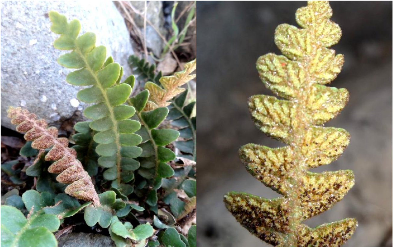
Figure 2. Asplenium punjabense Bir, Fraser-Jenk. & Lovis.