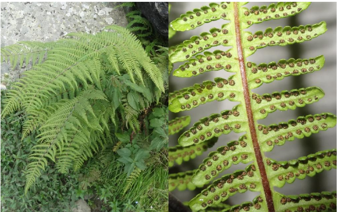
Figure 3. Pseudophegopteris pyrhorachis (Kunze) Ching, subsp. distans (Mett.) Fraser-Jenk.