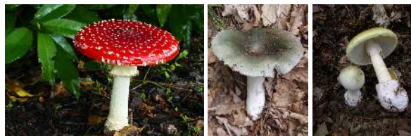
Figure 1. One image of a mushroom ( Muscaria ) may be enough to recognize it in the wild (left); in other cases, there may be more subtle differences between an edible ( Russula , shown in the center) and a deadly one ( Phalloides , shown on the right), but still few samples are enough for humans.

We propose a method for learning embeddings for few-shot learning that is suitable for use with any number of shots (shot-free). Rather than fixing the class prototypes to be the Euclidean average of sample embeddings, we allow them to live in a higher-dimensional space (embedded class models) and learn the prototypes along with the model parameters. The class representation function is defined implicitly, which allows us to deal with a variable number of shots per class with a simple constant-size architecture. The class embedding encompasses metric learning, that facilitates adding new classes without crowding the class representation space. Despite being general and not tuned to the benchmark, our approach achieves state-of-the-art performance on the standard few-shot benchmark datasets.