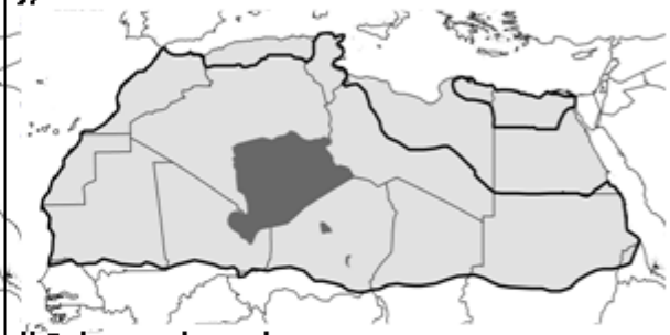
l) Saharan cheetah