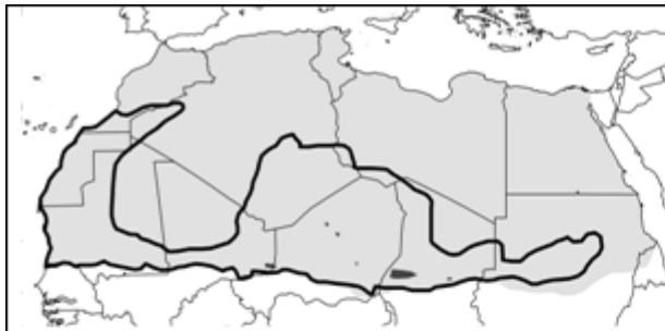
i) Dama gazelle