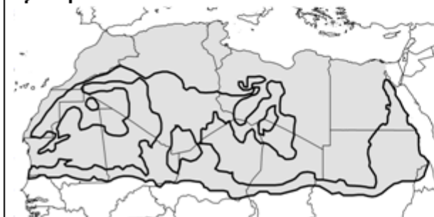
m) African wild dog