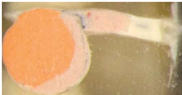
Figure 2. Cross-section showing simulated lateral canal filled with gutta-percha and sealer (Group 2 – medium third).