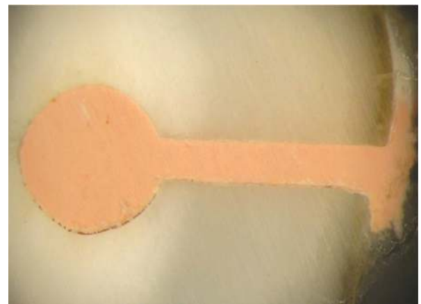
Figure 3. Cross-section showing simulated lateral canal filled with gutta-percha (Group 1 – coronal third).