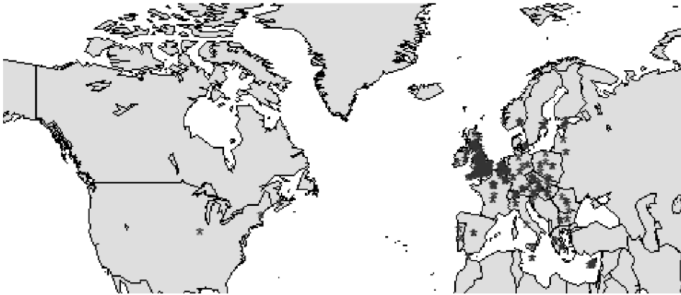
Figure 1. Geographical allocation of the entities notified on the Polish territory

Figure 1 and Table 2. Cyprus and the Netherlands locations are rather linked to the tax management while the UK locations to capital management projects. There are instances of notification of an entity located in USA.