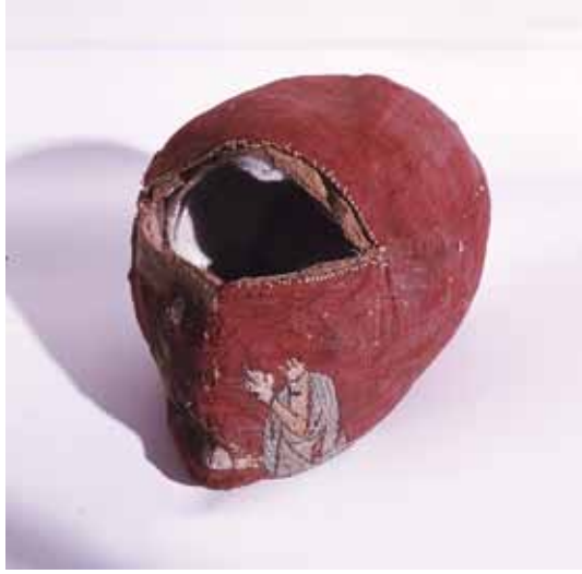
Fig. 7. The skull relic of St Henry of Uppsala or St Eric of Sweden at Turku Cathedral is wrapped in Chinese red silk damask with an embroidered figurative scene.

A closer examination of St Eric's finger relic revealed that the textile wrapping does not contain any kind of bones at all, but instead a piece of black textile. The textile ( 575 \pm 30 BP, 95.4 %, Ua-37859) and the thread ( 560 \pm 30 BP, 95.4 %, Ua-37853) date to the fourteenth century, while the parchment is from the eleventh to thirteenth century ( 881 \pm 36 BP, 95.4 %, Ua-38647). There are several ways of interpreting the situation, but perhaps most likely option is that an erroneous parchment slip was added to the wrapping at some later period. In multispectral filming, where parchments were exposed in various light spectra, the authentica of the relic did not reveal palimpsests or other signs of reuse, but still the slip is older than the wrapping around the relic. This could be read as supporting the idea of a wrong authentica being attached to the relic at some point in time.