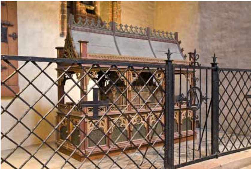
Fig. 4. The late-medieval wooden casket traditionally attributed to the Blessed Hemming is on display at Turku Cathedral.

Another hint of continuing cult practices are the ruins of the Chapel of St Henry on Kirkkoluoto Islet in Köyliönjärvi Lake, West Finland (Salminen 1905, Ahl 2005). According to the oral tradition, the chapel was founded by