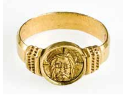
Fig. 6. A fifteenth-century vernicle finger ring of gold found in Ulvila.

Olof Kolsrud (1943: 188–93; cf. Hildebrand 1884–98: 417–18) states that since ancient times, the finger upon which the ring was put was important. The digitus medicus , or the ring finger on the left (or right) hand was very significant, since it was considered to have a nerve or vein leading straight to the heart. Carl af Ugglas (1951: 191–5) connects the digitus medicus belief to the heart symbolism present in the late medieval rings. The use of magical rings on the ring finger made them transmitters of a sort with a direct line into the core of the user's soul. The devotional dimension of finger rings can be thus connected with the medical belief that there was a direct physiological link between the ring finger and the heart.