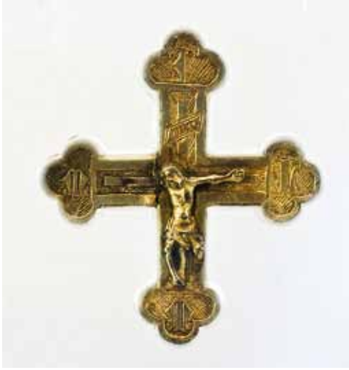
Fig. 8. A reliquary cross, found in the medieval altar of Föglö Church. The piece is c. 6 cm in height and made of gilt silver in the early sixteenth century.

2000: 116). Stephen Clucas (2000: 115–16) describes this bodily constitution of a sacred space as translation of the body: the lived body and its desire for an invulnerable soul are articulated spatially and translated into space.