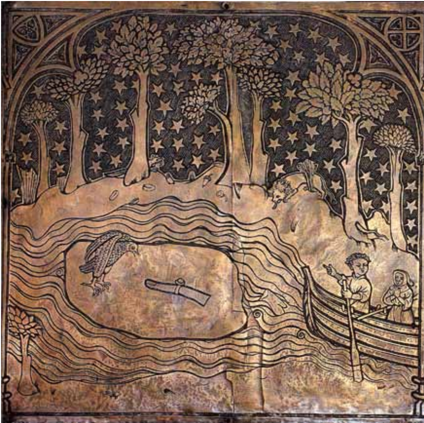
Fig. 3. The miraculous discovery of St Henry of Uppsala's finger as engraved on one of the 1420s brass plaques fitted on the saint's sarcophagus in Nousiainen Church in Southwest Finland.