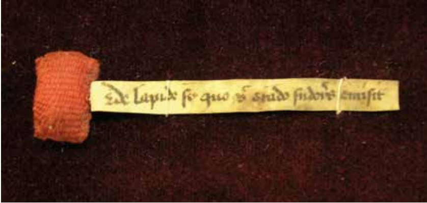
Fig. 2. The relic containing a stone from Gethsemane at Turku Cathedral.

The Department of Archaeology at the University of Turku began to study the finger relic of St Eric and other items in the assemblage of Turku Cathedral in 2007 (Taavitsainen 2009). Relics and reliquaries are being opened and documented and organic as well as inorganic samples are being taken for a range of scientific analyses. So far the project has concentrated on building a chronological chart of individual artefacts. The oldest dating, calAD 255–408 (1706±30 BP, 95.4 %, Ua-40201), has been obtained from a piece of fur discovered inside the alleged reliquary of St Gertrud. Such an advanced age is exceptional, since the majority of the relics date to the fourteenth century, although much more recent datings have also been obtained. The challenge of the project is not to stop here, when a better understanding of materials, their origins and age has been accomplished, but to use the results as a stepping-stone into a study of the practices of medieval relic veneration. Medieval bodies and those material processes which authenticate relics, or distinguish saints' bodies from other human remains, are thus at the heart of the following discussion of embodiment.