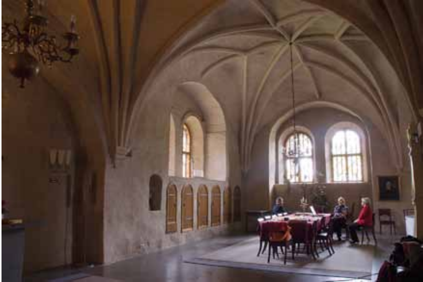
Fig. 5. The sacristy of Turku Cathedral. Part of the relic collection was found in a bricked-up recess in the wall in 1924. The recess, which now has a fitted wooden door, is the furthest one from the camera.

St Henry of Uppsala himself. The site was quite clumsily excavated in the early twentieth century, but the finds nevertheless include medieval artefacts: a pilgrim badge, fragments of window glass, a gold ring, and coins from the first half of the fifteenth century onwards (Hiekkanen 2008: 157–8). Interestingly, a significant portion of the coins were minted as late as the eighteenth century. They have been interpreted as offerings made by locals to St Henry long after the official end of the relic cult.