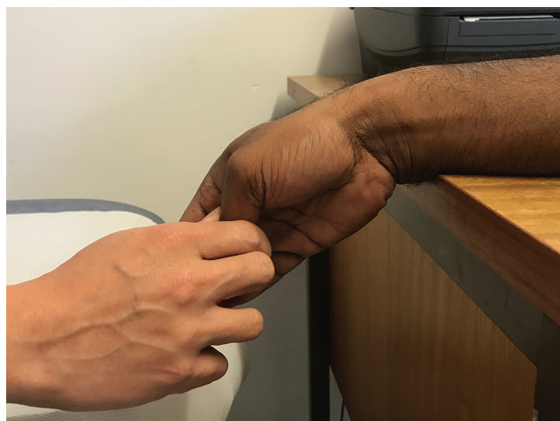
Fig. 1 Finkelstein's test on the patient.

The first description of the test to evaluate de Quervain's tenosynovitis was by Finkelstein in 1930, which stated that pain was elicited on traction of the thumb, which was worsened with ulnar deviation of the hand. 3 Eichhoff's variant of this manoeuvre involved the thumb gripped in the palm by the other fingers followed by passive ulnar deviation of the wrist with, which caused severe discomfort. 4 Eichhoff used this manoeuvre to illustrate his understanding of the pathomechanics of the disease process, namely stretching the