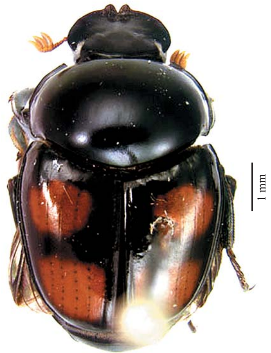
Fig. 3. Canthon aff. quadriguttatus .

at least two occasions the juvenile from the populated group was observed picking a dung beetle out of its fur and flicking it off its body. However, the dung beetle was observed flying back onto the monkey.