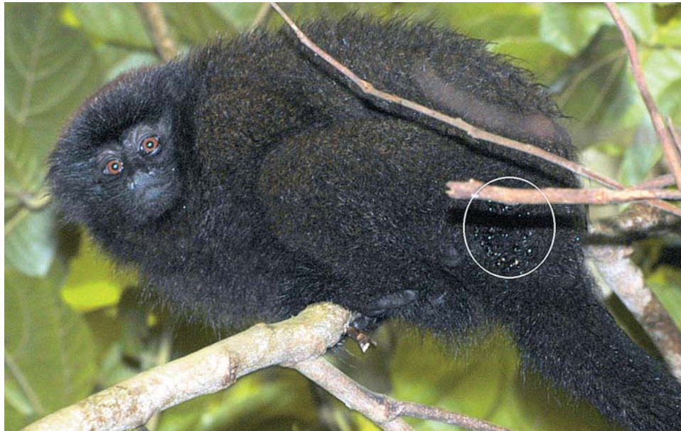
Fig. 1. Brown titi monkey from the infested family group with many C. quadriguttatus attached to the fur above the tail.