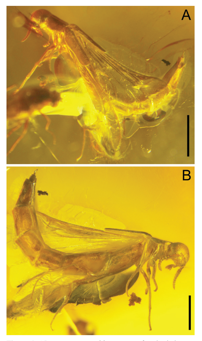
Figure 1. † Raractocetus sverlilo sp. nov., female, holotype, SIZK L-814. A. General habitus, dorsolateral view; B. General habitus, ventrolateral view. Scale bars: 1.0 mm.

Type locality. Voronki locality (Varash district), Rovno Region, Ukraine.