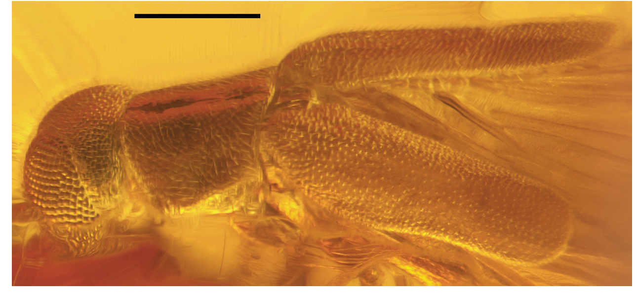
Figure 2. †Raractocetus sverlilo sp. nov., female, holotype, SIZK L-814: forebody, dorsolateral view. Scale bar: 0.5 mm.

straight, not extending beyond metacoxae; surface covered with dense, short obliquely protruding pubescence.