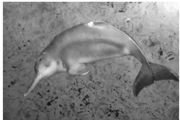
Figure 1. Yangtze River dolphin or baiji ( Lipotes vexillifer ). Male individual ('Qi Qi'), held at the Wuhan dolphinarium from 1980 to 2002.

The baiji is the only recent representative of the Lipotidae, a clade that diverged from other cetacean lineages more than 20 Myr ago (Nikaido et al. 2001). Its extinction represents the loss of a disproportionately large amount of mammalian evolutionary history (Isaac et al. 2007), and only the fourth disappearance of an entire mammal family since AD 1500 (MacPhee & Flemming 1999). It also represents the first documented global extinction of a 'mega-faunal' (greater than 100 kg) vertebrate for over 50 years, since the disappearance of the Caribbean monk seal ( Monachus tropicalis ) in the 1950s (MacPhee & Flemming 1999), and the first such species extinction since the emergence of an international network of