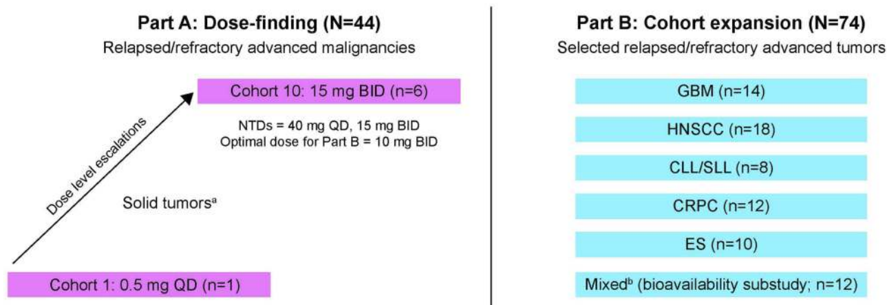
Figure 1 Study design. In Part A, an accelerated titration design was used to establish toxicity and QD and BID dosing were evaluated. Initial cohorts of 1 patient each were administered CC-115 at dose increments of 100% in 28-day cycles until \geq grade 2 toxicity, after which a standard escalation dosing schedule with approximately 50% dose increments and 6 patients per cohort was initiated. In Part B, patients with protocol-specified tumors received CC-115 10 mg BID. a GI (25%), sarcoma (14%), biliary, breast, GYN, lung, NET, skin (7% each), CNS, renal, other (4% each), endocrine, GU, pancreas (2% each). b Breast (5 patients), ovary (2 patients), NSCLC, PEComa, CRC, thyroid, sarcoma (1 patient each).

Adults with histologic or cytologic confirmation of advanced solid or hematologic malignancies, who had progressed on standard anticancer therapy, were eligible for Part A of the study. An Eastern Cooperative Oncology Group Performance Status (ECOG PS) of 0 or 1 and fulfillment of prespecified laboratory criteria (absolute neutrophil count [ANC] \geq 1.5 \times 10^9/L ; hemoglobin \geq 9 g/dL; platelet count \geq 100 \times 10^9/L ; aspartate aminotransferase and alanine