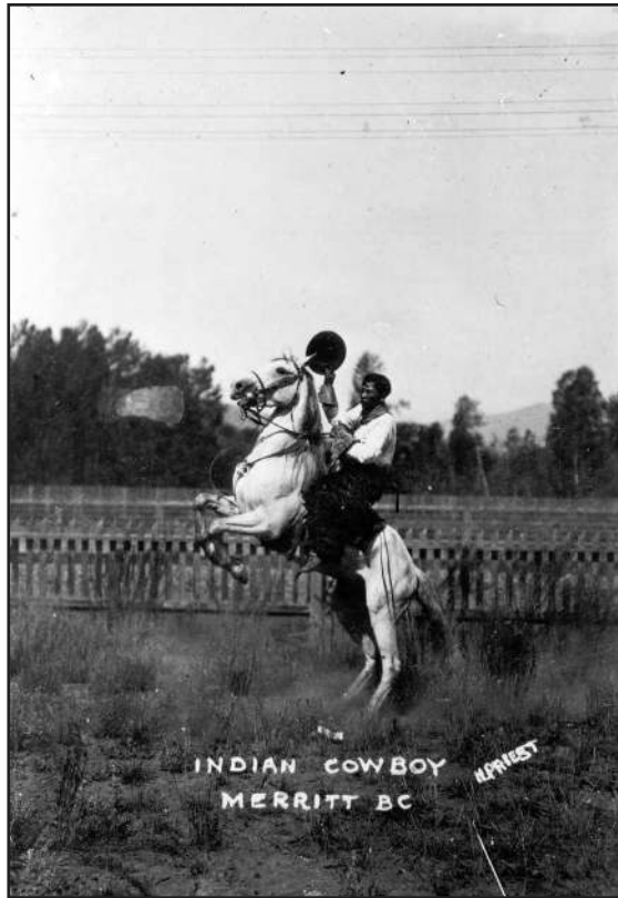
Figure 2: Indian Cowboy in the Nicola Valley (photo courtesy of the Nicola Valley Museum Archives Association, photo #PN80).

Alexander Ross (1965: 111), while travelling near Fort Okanagan in 1811, saw a group of natives and commented that “the party were all mounted on horseback to the number of seventy-three, and exhibited a fine display of horsemanship.”