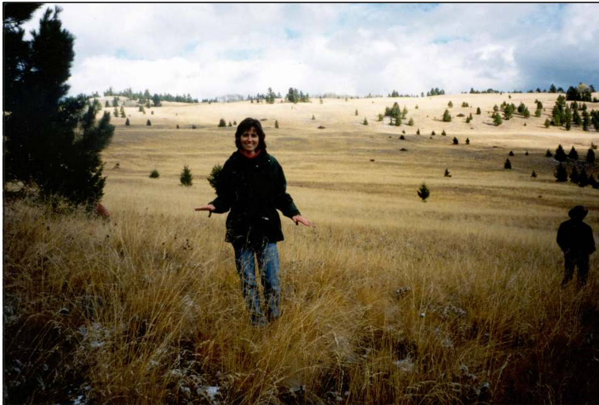
Figure 3. “Belly-high” bunchgrass on upper elevation site.

A common theme among Anderson, Higgs, and the Society for Ecological Restoration is the inclusion of social values in restoration projects. Anderson goes further to suggest that restoring the forces that shaped the model community is essential, a perspective that mandates the inclusion of pre-contact management practices in restoration plans. Higgs and Kimmerer include traditional ecological knowledge in their discussions of restoration. To some degree, all of the above sources also include ecological concepts inherent in western science. The authors are suggesting that social values, forces that shape the biophysical environment, and traditional ecological knowledge