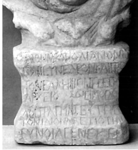
Figure 2: bust from Macedonia, detail

been used in the Roman era. On the slope of the hill, however, about 500 metres away, are remains of a settlement from the imperial age, which may be connected with the new find. This was probably a villa rustica , one of many that have been discovered scattered across ancient Mygdonia. This hypothesis is borne out by the inscription ( fig. 2 ) on the base of the sculpture: 6