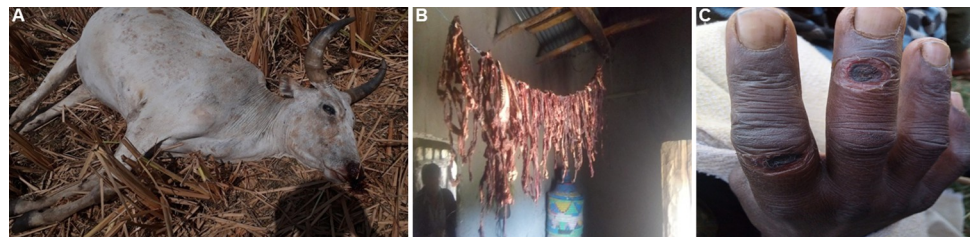
Fig 2. Photographs taken during outbreaks of anthrax in Amhara region, northern Ethiopia, 2018–2019. A, deceased cow displaying typical bleeding from the nose in Sahila village, Wag Hamra zone (Outbreak 1); B, dried (goat) meat that tested qPCR-positive in Farta village, South Gondar zone (Outbreak 2); C, cutaneous lesions ('black eschars') on qPCR-positive case in Farta village, South Gondar zone (Outbreak 2).

In total, 55 persons in the village (including the owner) came into direct contact with the infected carcass of the index cow through the skinning/butchering process or by consuming the meat, handling the meat/hide or disposing animal products, many without using any protective clothing or equipment. Twenty-two people developed painless, vesicular cutaneous lesions with itching sensation, typical of anthrax, on the arm, finger, leg or back, resulting in an overall attack rate of 40%. The highest attack rate was observed in people aged \geq 41 years, with comparatively lower attack rates in younger people (Table 2; p = 0.054 ). Higher attack rates were observed in women, although this was not statistically significant (Table 2; OR = 1.29 [95% CI: 0.42, 3.9], p = 0.65 ). Two cases (females aged 16 and 35 years) were suspected to have died due to the disease, resulting in a case fatality rate of 9%; both fatal cases manifested clinically as cutaneous and ingestion anthrax, although this diagnosis was not confirmed as post-mortem samples were not taken. Blood samples were collected from 13 people with suspected cutaneous anthrax, of which three were found to be positive on qPCR. None of the four swab samples collected from humans with cutaneous lesions tested positive for anthrax. All people with suspected cutaneous anthrax were treated with doxycycline and were