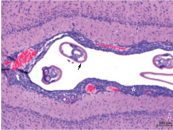
Fig. 2: Angiostrongylus cantonensis young adult worms (arrow) associated with meningitis, consisting of vascular congestion and intense macrophage infiltration (asterisk), with less number of lymphocytes ( Rattus norvegicus at 25 days post-infection) (HE, 100x).