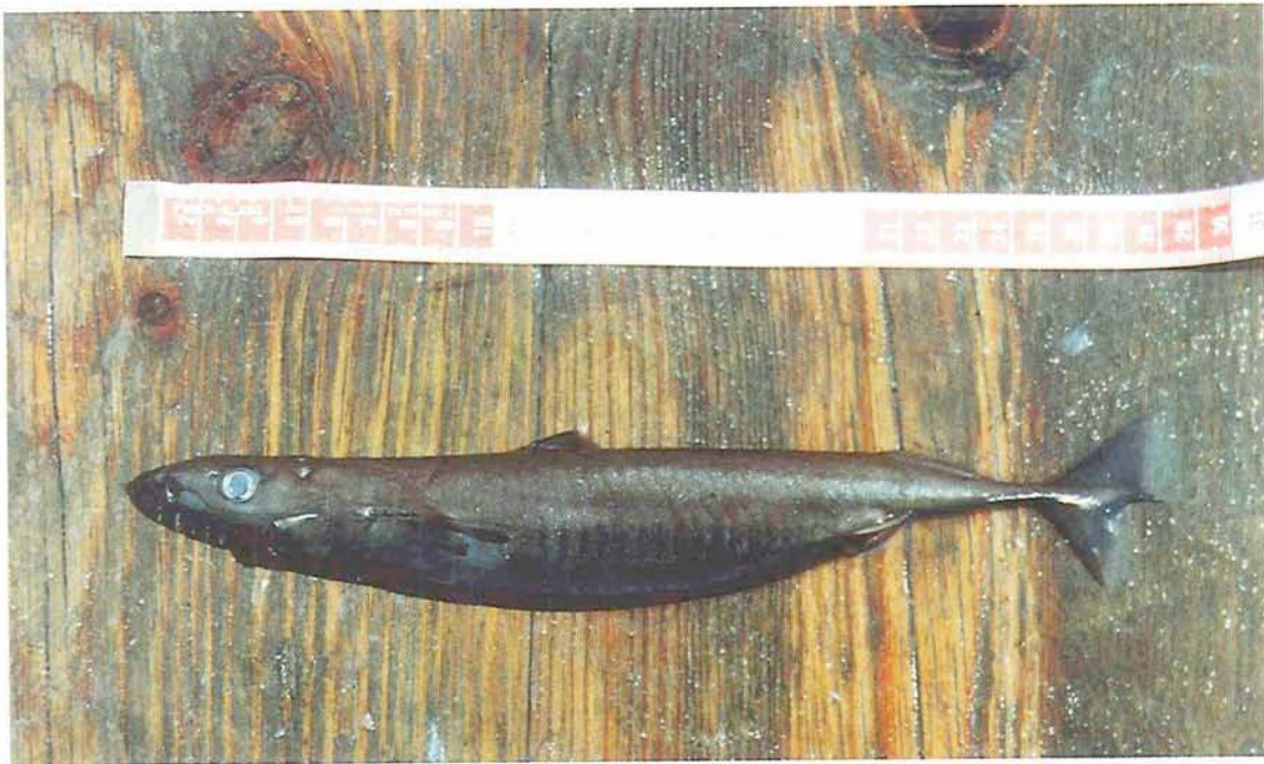
Fig. 1. Lateral view of the female Squaliolus laticaudus (275 mm TL) captured in the Azores in March 1997. A metric tape is shown at the top (colour shift equals 10 cm). Note that the specimen is not accurately aligned with metric tape.

laticaudus in the Azores Islands, extending its distribution in the Macaronesian archipelagos (Azores, Madeira, Canary and Cape Verde) (LLORIS et al. 1991; SANTOS et al. 1995) and in the North-eastern Atlantic Ocean. During the Spring (21 March to 18 May) of 1997, a demersal fish cruise survey carried out by the R/V Arquipélago , took place in the Azores (the ARQDAÇO-08-P97 cruise). Depth strata ranging from 50-1200 m depth were fished using bottom longlines with hook number 9 baited with horse mackerel, Trachurus picturatus (Bowdich, 1825). On March 24, 1997, a female of S. laticaudus (Fig. 1) was captured on the Princess Alice Bank (38° 02' N; 29° 21' W), SW of Faial Island, Azores, at a bottom depth of approximately 700-750 m.