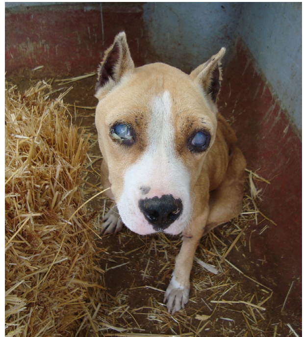
Figure 1. Bilateral purulent blue keratitis in a dog, with surra.

The clinical examination showed significant muscular emaciation and bilateral keratitis with corneal opacity and impaired eyesight (Fig. 1). The lymph nodes were not enlarged but, due to the high prevalence of canine leishmaniasis [2] and babesiosis [11] in Tunisia, a blood smear and a lymph node biopsy were performed, they were negative for Babesia spp. and Leishmania infantum but showed high population of Trypanosoma spp. (Fig. 2). The dog presented hypoglycaemia (0.76 g/L), uraemia (0.9 g/L), hyperproteinaemia (84 g/L) and normocytic (71.7 fl) normochromic (31.6 g/dL) regenerative anaemia (6.8 g/dL) with severe thrombocytopenia ( 5 \times 10^3/\mu L) (Table 1).