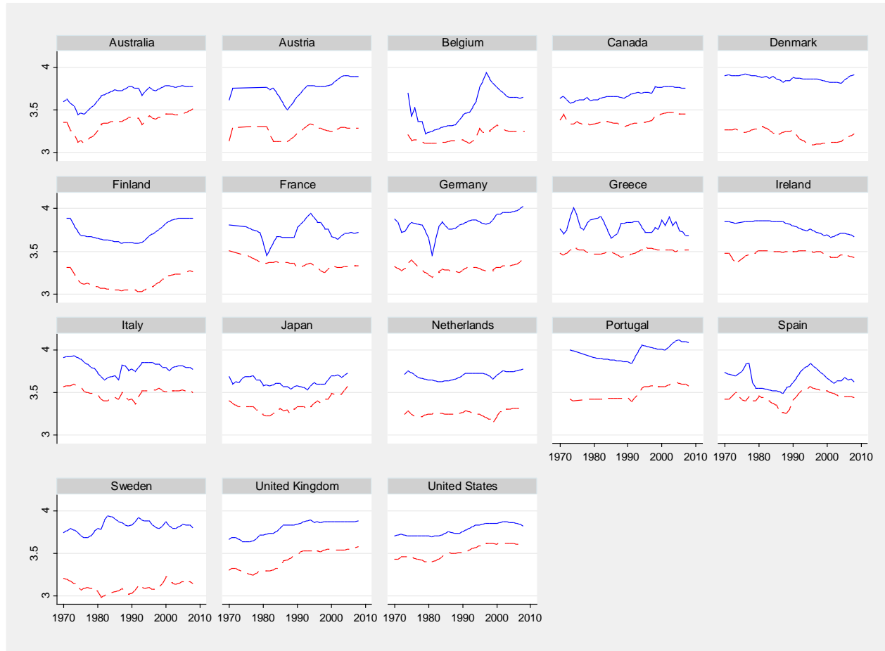
List of Figures Figure 1. Gross and net income Gini Indexes.

Note: The blue line denotes the gross income inequality index, while the red line corresponds to the net income inequality index. Both series are expressed in log terms. The correlation between gross and net income inequality is relatively low (0.37). This is not surprising for advanced countries where, in contrast with developing countries, differences in redistributive policies are much more relevant at explaining differences in net inequality.