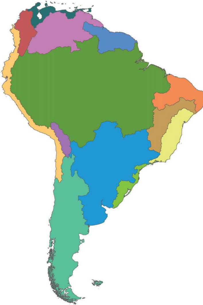
FIG. 3. Major river basins and basin complexes of South America. ■, Amazon; ■, East Atlantic; ■, Guianas; ■, Magdalena; ■, Maracaibo-Caribbean; ■, North-east Atlantic; ■, North-west Pacific; ■, Orinoco; ■, Parana-Paraguay; ■, South-east Atlantic; ■, Southern Cone; ■, São Francisco; ■, Titicaca.

Basin is dominated by several groups of ostariophysans and cichlids. Several other fish groups are also emblematic for the basin. The freshwater stingrays are not restricted to the Amazon, but their greatest diversity occurs there. The Amazon and Paraguay basins share the only South American sarcopterygian (lobed-fin) fish, the lungfish Lepidosiren paradoxa Fitzinger 1837, locally called pirambóia. Also very important, both evolutionarily and economically, is the pirarucu Arapaima gigas (Schinz 1822), the largest freshwater fish in South America. Along with the pirarucu, two species of aruanã ( Osteoglossum spp.) represent the primitive order Osteoglossiformes in the