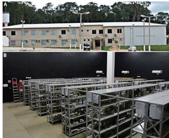
Figure 1. External view of the building of the Coleções Zoológicas e Laboratório Integrados (A) and internal view of the fish collection of the Universidade Federal de Rondônia (B).

five computers connected to a server for simultaneous cataloging of different lots. Labels are printed with indelible ink ( DuraBrite Epson ® ), which makes the text resistant to discoloration even when the label is immersed in liquid. The paper used for the manufacture of labels ( Resistall Paper ® ) has cotton fibers and is treated for longer durability and high humidity resistance.