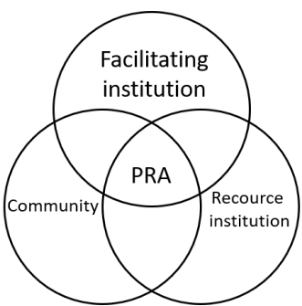
Figure 2. Critical components in the participatory rural appraisal method as described by (Koralagama, Wijeratne, & SIlva, 2007)

At the stage of training and group assistance in implementing CSR programs, the company cooperates with facilitators from outside the company and outside the village, namely researchers and practitioners. The facilitator acts as a person who transfers new knowledge to the community and bridges between outsiders and parties within the community itself.