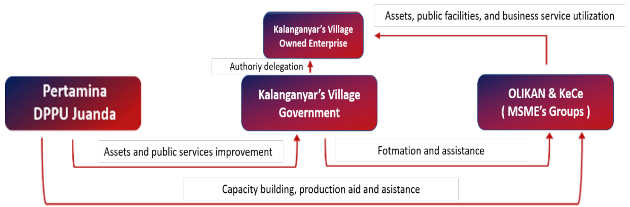
Figure 3. The position of the company (CSR), the village government, and the community in the synergy of developing MSMEs in Kalanganyar Village.

participation by the village government. In addition, BUMDes receives delegation of authority from the village government to carry out business activities that are not only profit-oriented but also contribute to the community's economic development. Therefore, public services related to the utilization of village assets and business services that MSMEs can access are carried out by BUMDes.