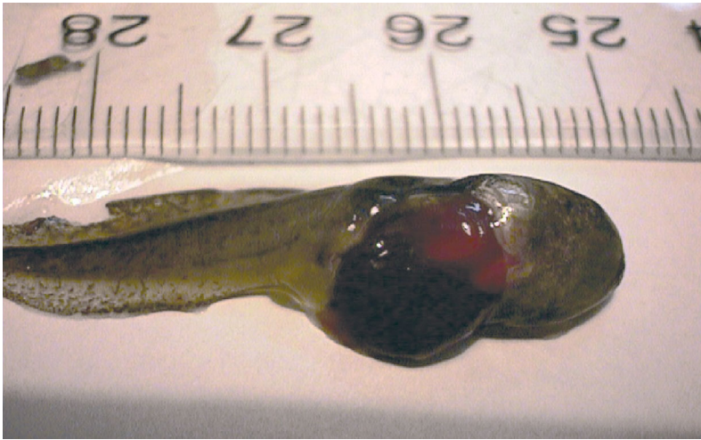
Fig. 1. Rana sylvatica . Example of a systemic hemorrhage

ity events involving more than 100 individuals in June of 1999, 2000 and 2001. More than 50 Rana sylvatica were found dead at the Kortright Pond in June 2001, and over 100 Rana pipiens metamorphs were found dead at Gannon's Narrows in August 2002. Necropsy observations included edema of the body cavity, poor fat body composition, pale and mottled colouration of the liver and systemic hemorrhage (Fig. 1). Cutaneous lesions and ulcers were not observed. In all mass mortality events, only 1 species of amphibian was involved despite the presence of a diverse amphibian community. In 4 events only tadpoles were infected, and these individuals ranged from Gosner stages 40 to 45 (Gosner 1960). Recent metamorphs were afflicted by only 1 mortality event, and no morbid or dead adults were observed at any of the locations. All 5 of the disease outbreaks in Ontario had onsets within a short time-frame between June and August. No mass mortality events were investigated between September and May. An accurate total number of individuals that succumbed to infection at each location is unknown. However, during 2000 and 2001 no new wood frog metamorphs were observed at the Oliver Pond. Also,