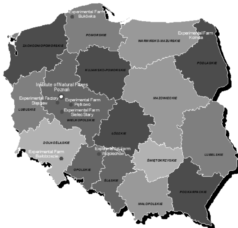
Fig. 1. Research Stations of the Institute of Natural Fibres and Medicinal Plants

Observations of weed infestation of fibrous flax in Poland have been conducted at the Institute of Natural Fibres and Medicinal Plants for over 40 years. This paper presents the results of research on changes in weed communities over the last four decades, focusing on former typical flax weed taxa, described as “flax specialists”. These taxa were common in the first half of 20 th century, described as “flax specialists” which included species like Lolium remotum Schrank, Spergula arvensis L. subsp. maxima (Weiche) O. Schwarz, Camelina alyssum (Mill.) Thell. and Cuscuta epilinum Weihe ex Boenn.