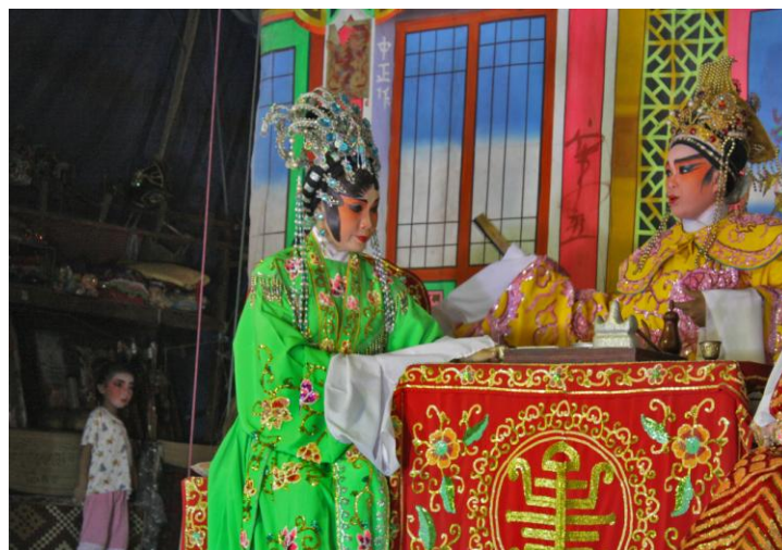
Figure 2: A little girl in the left corner has been recruited to be an opera singer at a very young age