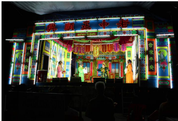
Figure 1: Teochiu Opera in Chonburi Province

province in the year of 2009. I encountered only one opera performer who was a Teochiu native speaker whereas the rest were not. Normally, opera singers cannot speak Teochiu dialect but sing the opera by memorizing every single word. They are recruited and trained at a very young age. Bao indicates that a new hybrid Chinese culture is created as Teochiu Chinese watch Isan performers imitate Teochiu opera. Interestingly, recruiting young people to be opera performers is akin to handing out the red envelope with some money inside. However, in this case, the opera singers are provided with a life-long employment as long as they can still engage in Teochiu opera business. Interestingly, although the native Teochiu speakers are no longer interested in performing the opera, the opera organizers are able to maintain their opera business which symbolizes their Chineseness while empowering themselves as economic providers to the impoverished population of Thailand.