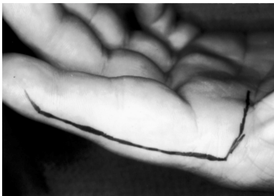
Fig. 6 A long midlateral incision on the radial aspect of the index finger. The incision continues across the palm at the level of the distal palmar crease and can be turned proximally to gain the required palmar exposure of the flexor system.

Pulvertaft later changed his thinking and agreed that free tendon grafting is often worthwhile in the small finger, particularly when the superficialis tendon is weak, because of the improvement in grip provided by the restoration of profundus function. He favored the use of the plantaris tendon in such circumstances. 231