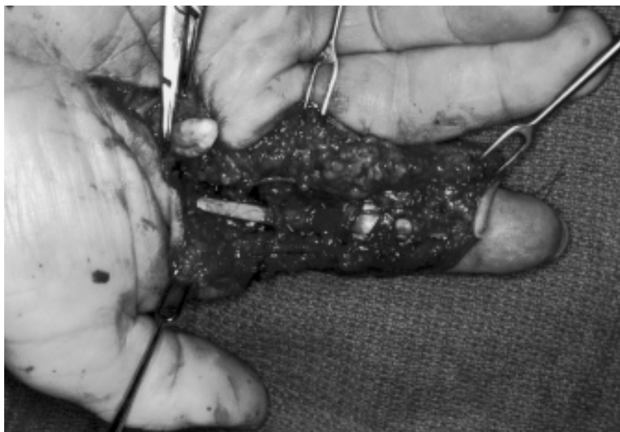
Fig. 5 The appearance of the digital bed following completion of the distal tendon-bone insertion and suturing of the distal profundus stump to the graft.

phalangeal joints held in nearly full extension. This position relieves tension on the repair site and provides the best safeguard against the development of flexion contractures of the interphalangeal joints. At three to four weeks, a gentle protected-motion program that includes passive and active digital flexion and active digital extension is initiated. Full passive extension of the digit is not permitted for several additional weeks.