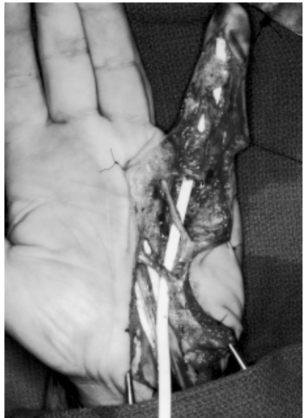
Fig. 9 A silicone tendon implant in a small finger during stage one of a two-stage flexor tendon reconstruction for functional salvage.

plemented by intravenous analgesia and tranquilizing drugs for tenolysis 237,238,243-245 . They contended that this method best allows the patient to demonstrate the completeness of the lysis by actively flexing the involved digit during surgery. They also believed that it is important to allow the patient to observe the improved digital motion during surgery in order to provide motivation for the maintenance of that motion during the rigorous postoperative therapy program. Most surgeons now agree that the advantages of local anesthesia and active patient participation are enormous and recommend the use of this technique whenever possible 239 . However, this type of local and supplementary anesthesia may not be appropriate for patients who are young or uncooperative, who have a low pain threshold, or for whom extensive surgery is anticipated. It then becomes the responsibility of the surgeon to demonstrate that a thorough release of all restraining adhesions has been achieved by the tenolysis procedure.