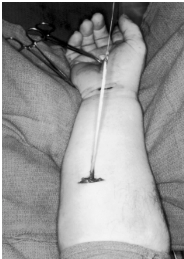
Fig. 4 The palmaris longus tendon has been withdrawn in the midpart of the forearm with use of two transverse incisions.

Most surgeons are much more reluctant to utilize early motion programs following grafting than they are following flexor tendon repair. It is generally believed that flexor tendon grafts should be immobilized for at least three weeks in order to avoid tension on the suture and to allow for revascularization 203 . Immobilization should be in a position midway between neutral and full wrist flexion, with the metacarpophalangeal joints flexed to 60° or 70° and the inter-