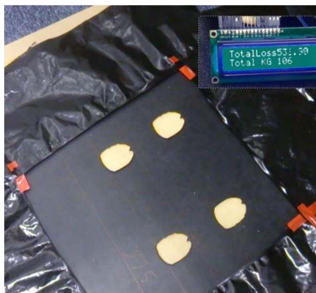
Fig 4. A 0.25m 2 P-Mat for weight estimation experiments, showing the position if the model hoofs (the distance between front and back hoofs is drastically reduced to allow a single human stepping with both legs). The periphery is masked to limit ambient light access.

pregnant sows, as such information is valuable for early detection of lameness and for planning their next gestation period. For this task, sensor mats can be positioned in locations where animal traffic is managed to allow gathering of data from a single sow at a time. The second task is optimal to address at drinking fountain locations. Both tasks are demanding in terms of the necessity to operate in hostile conditions – mechanical stress, aggressive liquids, etc. This requirement can be met by deploying rubberised mat sensor heads (see material “sandwich” in section III) containing zero-maintenance encapsulated electronics, connected though a single umbilical for power and data communications, to a networked node for contributing to the local general farm management, as well as the upstream and downstream food industry supply chains, including future IoT infrastructures.