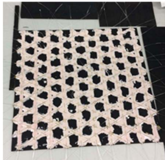
Fig.1. A P-Mat, at an intermediate stage of manufacture, showing the unconnected fibres arranged in a periodic structure. The fiber-optic grid is prepared to be placed together with the bespoke electronics into an enclosure designed to survive the farm environment without compromising performance.

2) The P-Mat was placed on top of a calibrated commercial force plate (Kessler) with human volunteers both standing and walking. The comparison of the data from the two sensors, P-Mat and the Kessler force plate, showed a correlation coefficient of 0.997. An additional test was performed with a 75kg human repeatedly stepping on the MDF hoof model positioned at a