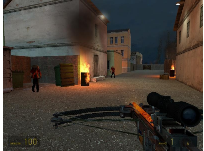
Figure 2. In-game screenshot for the level designed around the experiential concept of game boredom

Level design (see Figure 2) was a long iterative process carried out by game level designers and researchers from Blekinge Institute of Technology, using feedback in each design cycle from all research partners of the EU FP6 NEST FUGA project in an iterative refinement process.