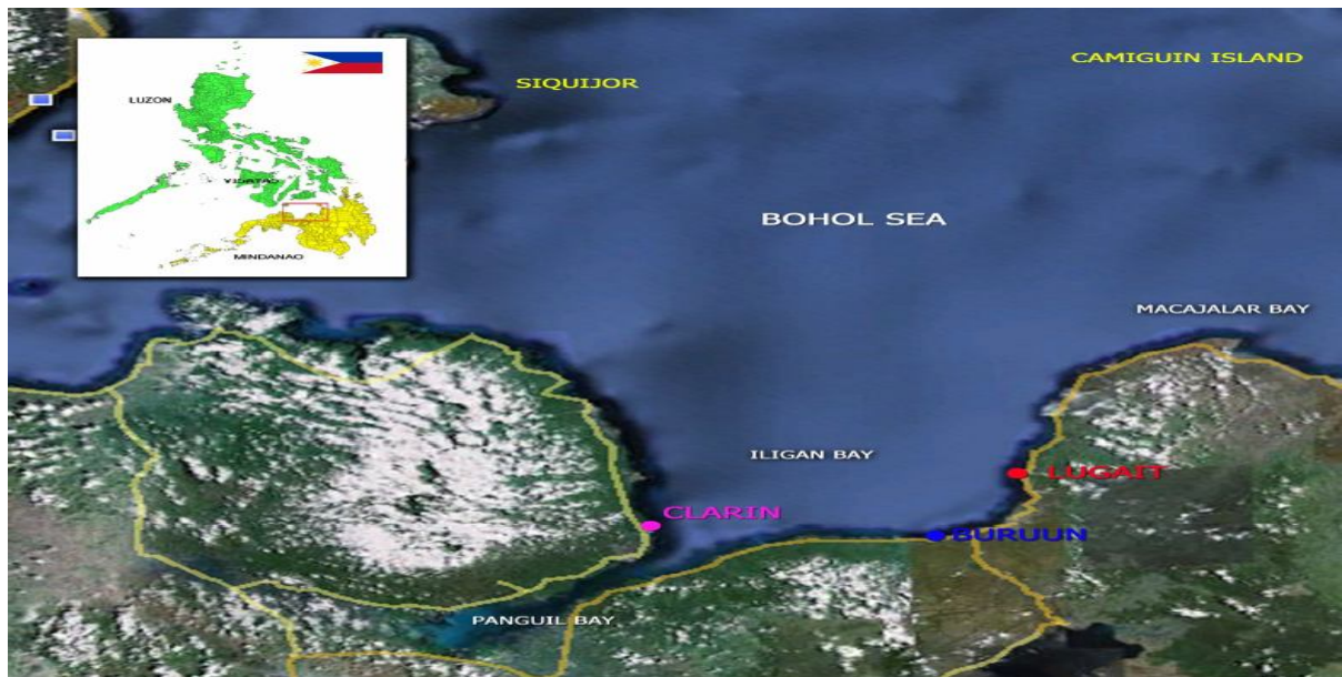
Figure 1. Map of the sampling locations: Lugait ( 8^{\circ}20'39.57\text{N} , 124^{\circ}15'29.07\text{E} ), Misamis Oriental and Buruun ( 8^{\circ}11'28.3\text{N} , 124^{\circ}10'33.59\text{E} ), Iligan City, Lanao del Norte, Mindanao, Philippines.