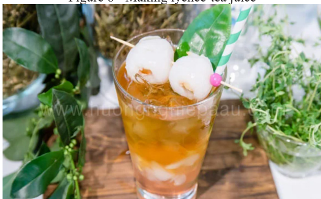
Figure 6 - Making lychee-tea juice

Then we can try to drink our delicious product as below figure showing: