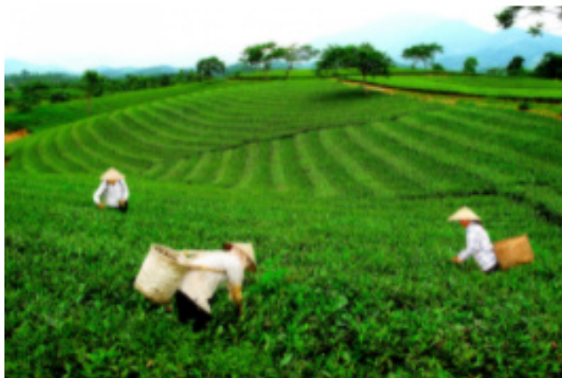
Figure 5 - Planting tea in Thai Nguyen province

From Thai Nguyen tea, we can process to make green or black tea and material to produce lipton tea.