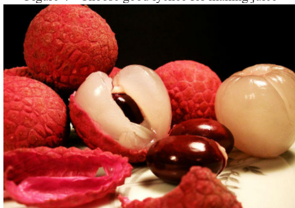
Figure 4 - Choose good lychee for making juice