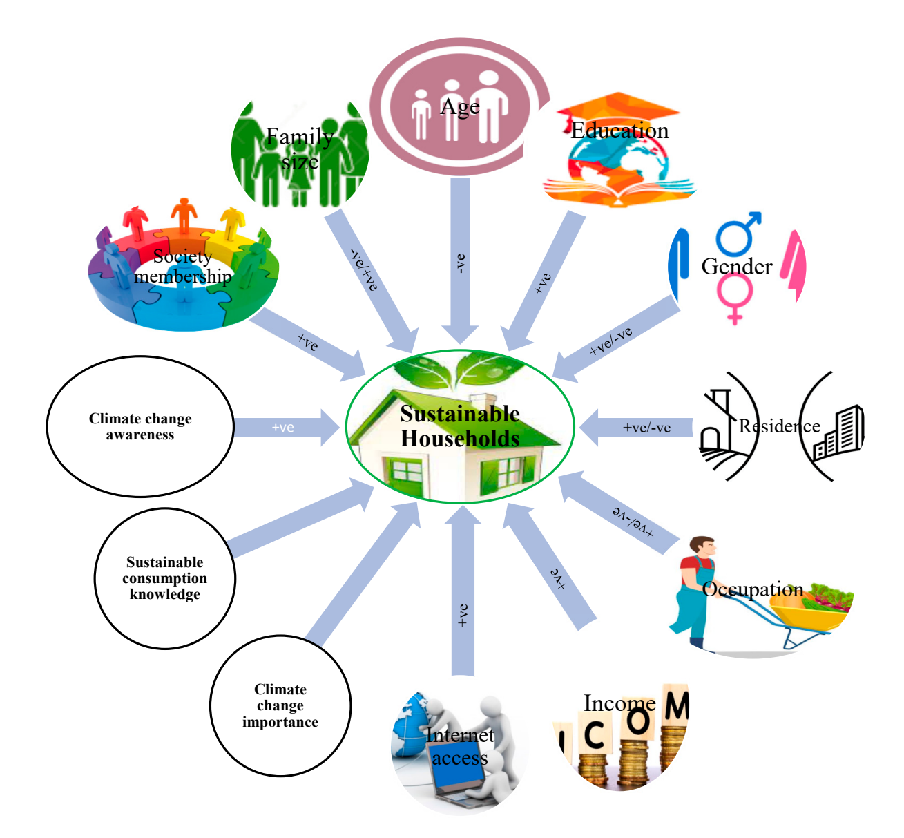
Figure 1. Expected relationship of explanatory variables with sustainable household practices.

A person having a non-agricultural occupation may have a positive impact on the adoption of sustainable household consumption practices. Income can play an important role in the adoption of sustainable household practices because rich and wealthy households are more likely to have efficient appliances and modern technologies at home. Having internet access and society membership is also supposed to have a positive impact on the adoption of sustainable household practices. In a similar way, this study assumes that knowing about sustainable practices and being aware of climate change will have a positive effect on the adoption of sustainable household consumption practices. Prior studies also signify the importance of climate change awareness and knowledge of sustainable household consumption practices for their adoption.