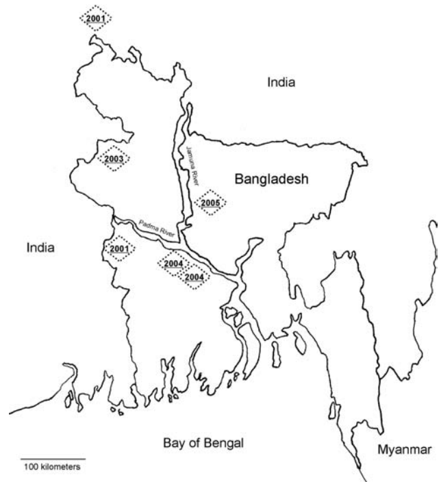
Figure 1. Location and dates of confirmed Nipah virus outbreaks in and near Bangladesh.

An experienced anthropology team conducted in-depth interviews with the families of each case-patient. The objectives were 1) to explore potentially relevant exposures; 2) to assist in framing questions for the case-control questionnaire within the context of the activities, understanding, and language of local residents; and 3) to identify appropriate proxy respondents for each case-patient. Topics covered in the interviews included details on expo-