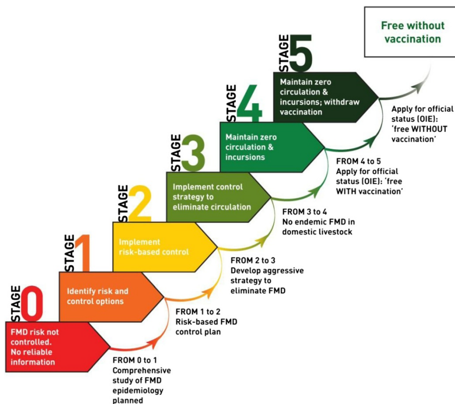
Figure 3 The FAO/EuFMD/OIE Progressive Control Pathway for FMD. The status of countries on the PCP-FMD is evaluated according to defined criteria. Countries with endemic disease are in stages 0 to 3 while countries with no endemic disease within livestock are at stage 4 or above.

required to achieve the outcomes have, however, not been prescribed. This non-prescriptive approach has the advantage that each country can adopt an approach according to its national/regional requirements and capabilities to achieve the outcomes. Understanding the “local” epidemiology of FMD and the active monitoring of the virus circulation are the foundations of the PCP-FMD and activities to meet these requirements are required in all stages [96]. Determination of the factors responsible for maintenance and spread of the disease and knowledge about circulating subtypes of FMDV are essential for effective control of the disease.