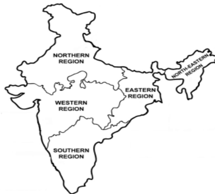
Figure 3. Indian Electricity Market

Indian electricity market is divided into five regions namely Northern, Southern, Western, Eastern and North-Eastern region as shown in Figure 3 (Girish et al., 2013)