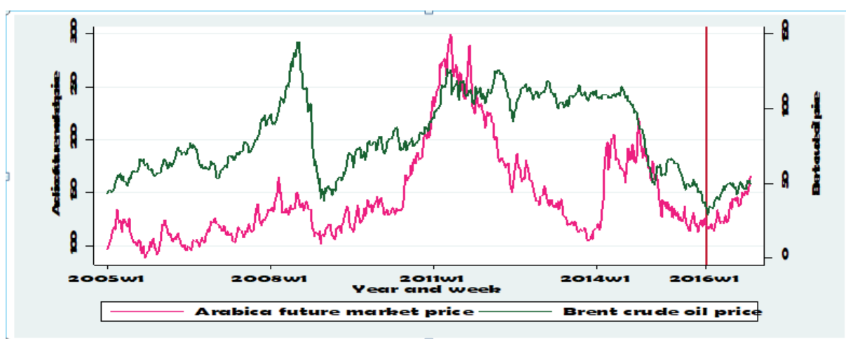
Figure 1. Time series plot for level series, Arabica coffee and crude oil.

As can be seen in Table 4, the best in-sample results are achieved by ARMA (2, 2) for both commodity log return series. Therefore, ARMA (2, 2) is the best (having minimum AIC & BIC) conditional mean equation for both