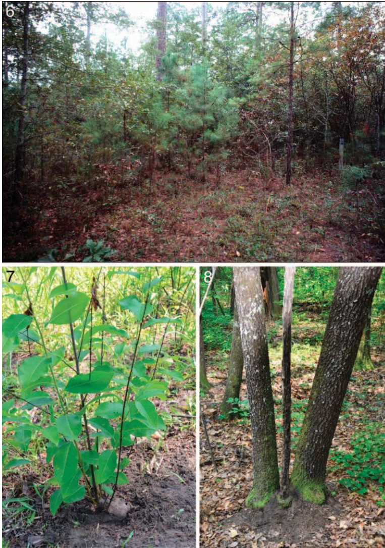
Figure 6. Photo taken in 1977 at nearly the same place as photos in Figures 4 and 5, which shows a thicket of young hardwoods growing from coppice and young pines growing from seeds, with a grassy opening in the foreground. See p. 438 in Engstrom et al. (1984) for a photo with the same view in 1981.