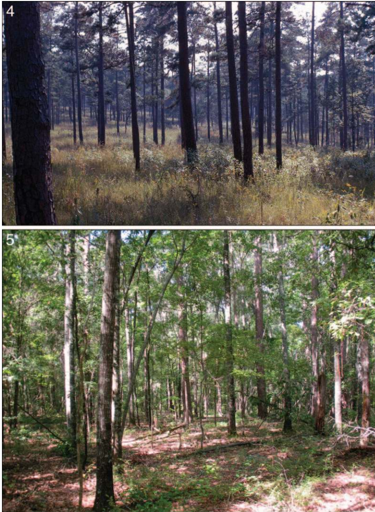
Figure 4. Open pine woodland of NB66 in 1967, looking southwest through plot A4. Dense, grass-dominated ground cover is evident with brushy hardwood coppice protruding above the grasses.