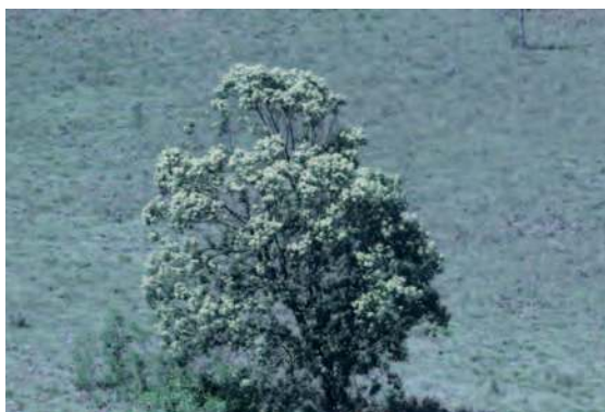
Black wattle has become an invasive species, altering riparian forest communities in many areas, such as South Africa

Generally, there have been equivocal results when the number of native plants in a system is compared to the number of introduced plant species in a