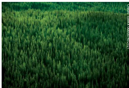
Evergreen trees on a mountainside in Banff National Park, Alberta, Canada

Genetic changes to the gene pool based on the actions of natural selection on the extant genetic diversity of in situ gene pools can follow a relatively rapid population decline or collapse following a disturbance, such as a major pest infestation. This process can then be reinforced by a longer-term process, whereby gene frequencies change more slowly in the directions forced by natural selection over many generations of subsequent breeding and reproduction. Individuals surviving a disturbance interbreed and propagate, favouring the gene frequencies of the surviving individuals. Over time, these gene frequency changes are enhanced and refined to create a better-adapted population. However, species that have inherently low levels of natural genetic diversity may not be able to adapt to relatively sudden challenges. For example, red pine is a tree species native to eastern North America that shows extremely low levels of detectable genetic diversity (Mosseler et al. 1991, 1992, DeVerno and Mosseler 1997). Natural populations of this species are vulnerable to pest infestations and infections by fungal pathogen such as Armillaria spp. and Scleroderris lagerbergii , which can eliminate entire populations (e.g., McLaughlin 2001).