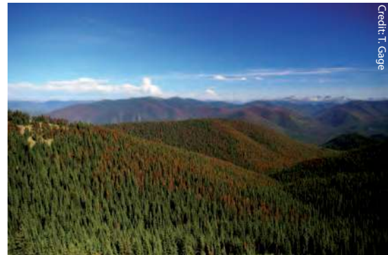
Lodgepole pine ( Pinus contorta ) killed by the mountain pine beetle (in red) in British Columbia, Canada

North America and Russia (Gillette et al. 2004, Soja et al. 2007). Our first case-study on lodgepole pine ( Pinus contorta ) reflects that prediction (table 4).