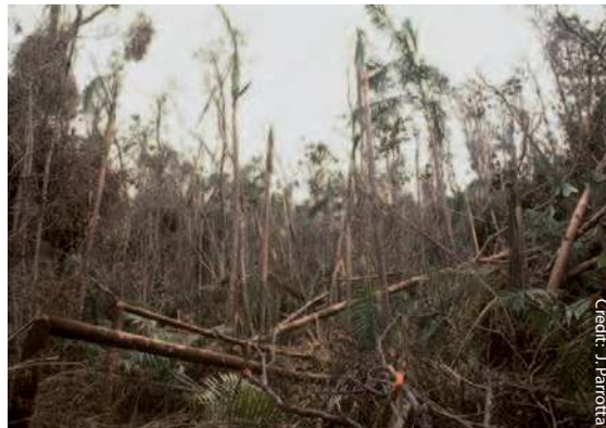
In many tropical regions such as the Caribbean, forests are adapted to periodic major disturbances by hurricanes. The resilience of these tropical forests enable their rapid recovery of structural and functional attributes. These photos of El Yunque National Forest, Puerto Rico, were taken two months after Hurricane Hugo in 1989.