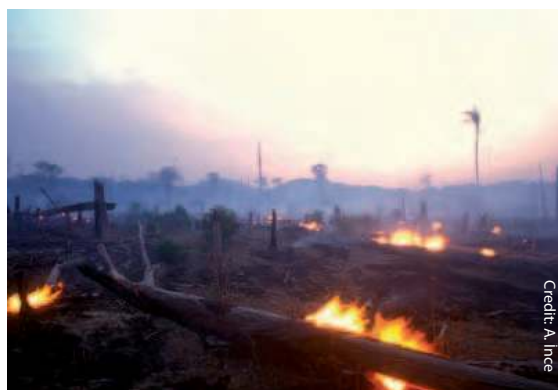
Forest fires in wet tropical forests can overcome the resilience of the ecosystem if they occur too frequently or over very large areas

Testing the theories of the relationship between diversity, productivity, and resilience in forests is difficult owing to the inability to control either extrinsic or intrinsic variables within these complex ecosystems. Furthermore, niche partitioning is well-known in forests (e.g., Leigh et al. 2004, Pretzsch 2005), with many uncomplicated examples such as tap and diffuse rooting systems, shade tolerant and canopy species, and xeric and hydric species. Some confounding effects also affecting production in forests include successional stage, site differences, and history of management (Vila et al. 2005). Species mixtures change with successional stage in forests, from those rapidly-growing species favouring open canopy environments to those capable of reproducing and surviving in a more shaded canopy environment. Various plant species are adapted to