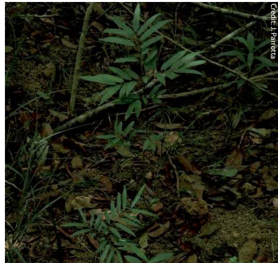
Following natural or anthropogenic disturbances creating forest gaps, regeneration from soil seed banks play a critical role in recovery of biodiversity in tropical forests. Location – Porto Trombetas, Pará State, Brazil.

Also in Costa Rica, tree species richness was correlated to increased production in afforestation experiments by Montagnini (2000), a result also reported by Erskine et al. (2006) for Australian tropical plantations of individual and mixed species. In one of the few published studies not to report a positive relationship between production and diversity, Finn et al. (2007) found that Australian