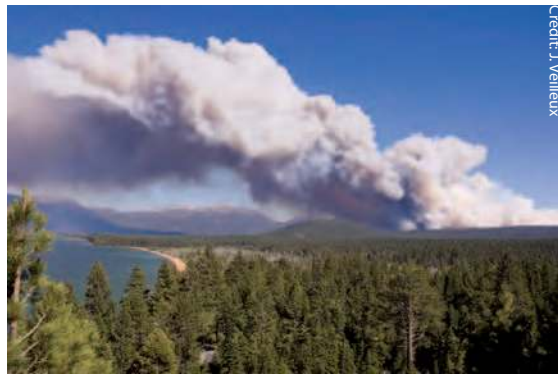
Cloud of smoke rising from the Angora forest fire in south Lake Tahoe, California

While the evidence above supports the notion that mixed-species forest ecosystems are more resilient than monotypic stands, some natural monotypic, or nearly monotypic, forests do occur. For example, in the boreal biome, natural stands of jack pine ( Pinus banksiana ), Scots pine ( P. sylvestris ), lodgepole pine ( P. contorta ), and Dahurian larch ( Larix gmelinii ) are commonly dominated by single species. These stands self-replace usually following fire over large landscapes, with no change in production over time. Similarly, in wet boreal systems where fire is absent, monotypic stands of a single species of fir ( Abies spp.) occur and generally self-replace following insect-caused mortality. Generally, these monodominant boreal forest ecosystems tend to be relatively short-lived and are prone to fire or insect infestation, and so while not very resistant (relative to other forest types), they are highly resilient ecosystems despite their lack of functional types and redundancy. The high degree of seasonality in boreal forests may contribute to the resilience among boreal monotypic stands, compared to in temperate and tropical biomes (Leigh et al. 2004), where forest species